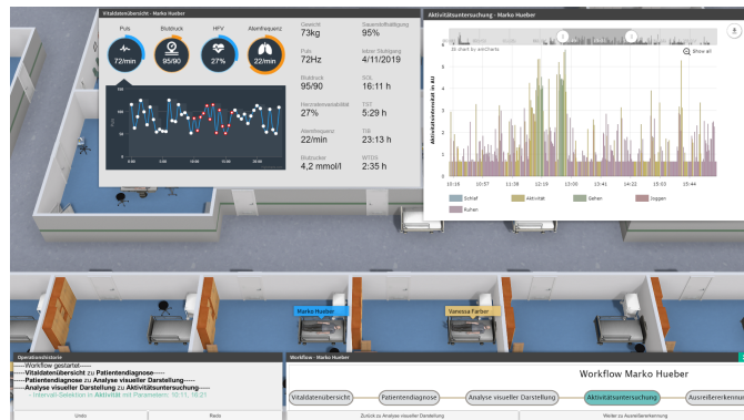
Fig. 3. Visualization of the workflow-oriented data analysis, where an analytical process is structured according to different workflow steps (shown at the bottom right) and executed in order to find cardiovascular anomalies. The data is linked between the Shimmer Monitor (shown at the top right) and the VD Dashboard (shown at the top left) by using Brushing & Linking mechanisms.

We already discussed that we want to integrate digital records, clinical findings and real-time vital and activity data from the existing data storages and stationary ICUs. However, we have also shown that it is possible to use additional